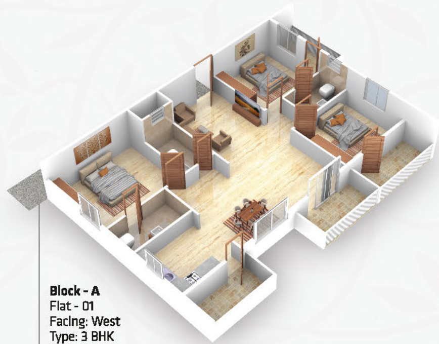
Block - A Flat - 01 Facing: West Type: 3 BHK