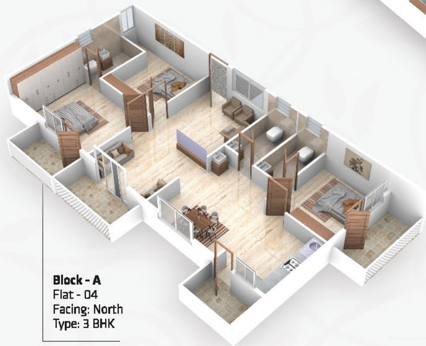
Block - A Flat - 04 Facing: North Type: 3 BHK