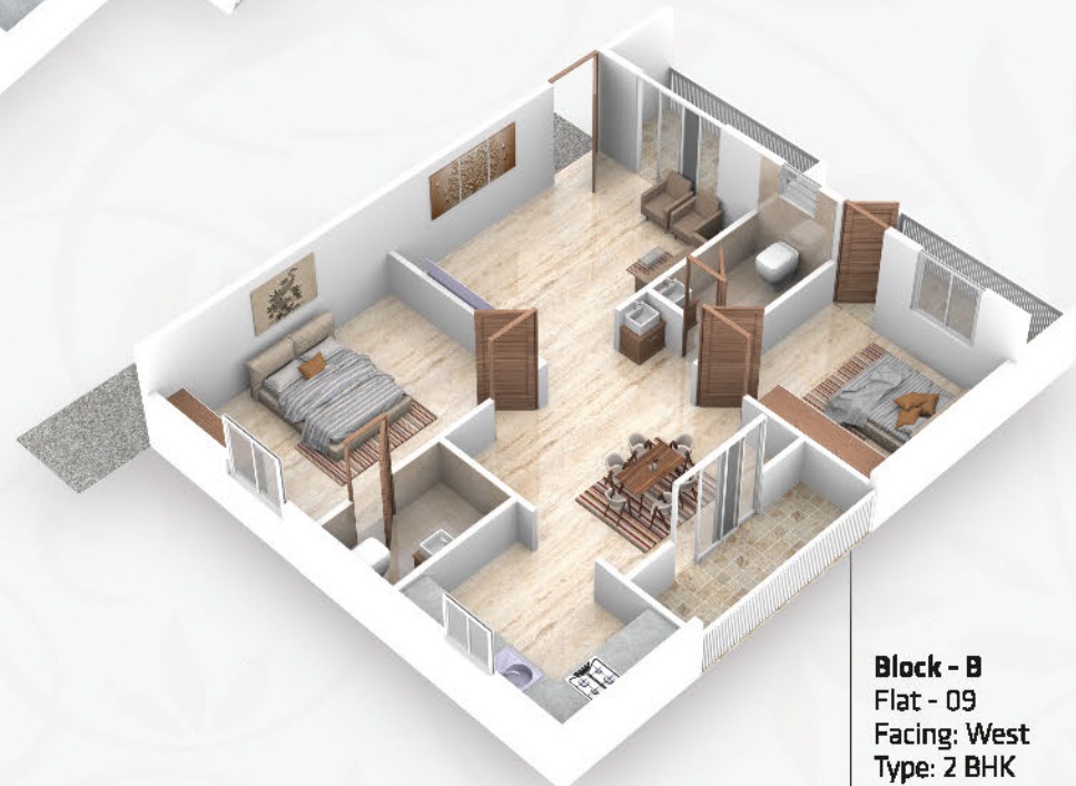
Block - B Flat - 09 Facing: West Type: 2 BHK