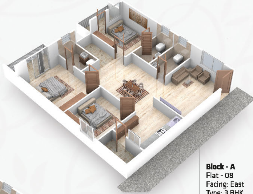
Block - A Flat - 08 Facing: East Type: 3 BHK